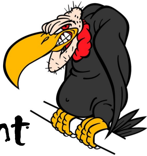
Photo Scavenger Hunt